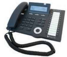
Edge 700 24-Button Phone