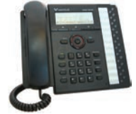
Edge 8000 24-Button Phone

MBX IP delivers IP applications on the following Vertical IP endpoints and softphone solutions*